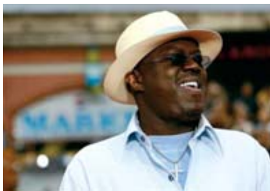
Bernie Mac smiles at the premiere of "Ocean's Thirteen" at the Grauman's Chinese theatre in Hollywood, California June 5, 2007. The movie opens in the U.S. on June 8.

LOS ANGELES (Reuters Life!) — Comedian and actor Bernie Mac, who starred in one of