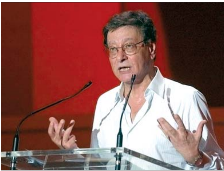
Mahmud Darwish is pictured during the 2005 international Carthage festival in Tunisia. Palestinians on Sunday mourned the passing of Darwish, who gave voice to their decades-old struggle and is widely considered one of the Arab world's greatest modern poets.

"History laughs at both the victim and the aggressor."